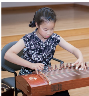
The Zeng, A traditional Chinese string instrument, being played by a young student of the Chiffon Music School