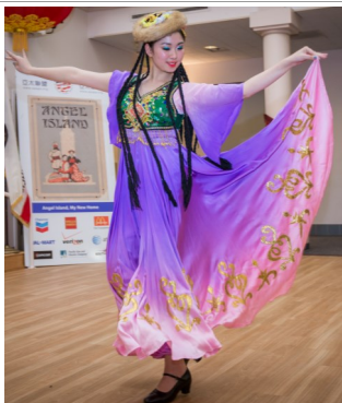
Uihgur Dance Performance, by a dancer from CPAA